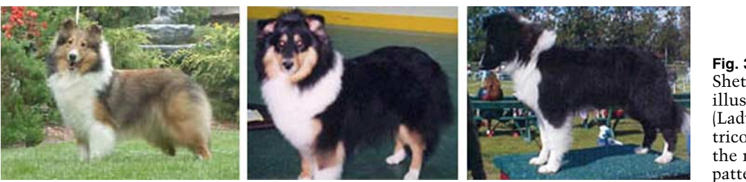
testing or knowledge of previous offspring. In Shetland Sheepdogs, there are additional opportunities that come from testing for the nonagouti R96C substitution, since dogs in this breed may be sable with white (a^{y}/a^{y}, a^{y}/a^{t}, \text{ or } a^{y}/a) , tricolor (a^{t}/a^{t} \text{ or } a^{t})

The a<sup>w</sup> and a<sup>t</sup> alleles. We found no difference in Agouti exon 4 sequences between dogs carrying the a^w and a^t and alleles (Table 2) nor in the coding sequence of a wolf or Gordon Setter. By analogy to black-and-tan (a^t) in laboratory mice, it seems most likely that a^t in dogs represents a regulatory alteration that inactivates expression of hair cycle-specific Agouti mRNA isoforms present in an ancestral a^w allele. Large-scale sequencing of flanking regions from genomic DNA of dogs of different Agouti phenotypes could provide additional insight.