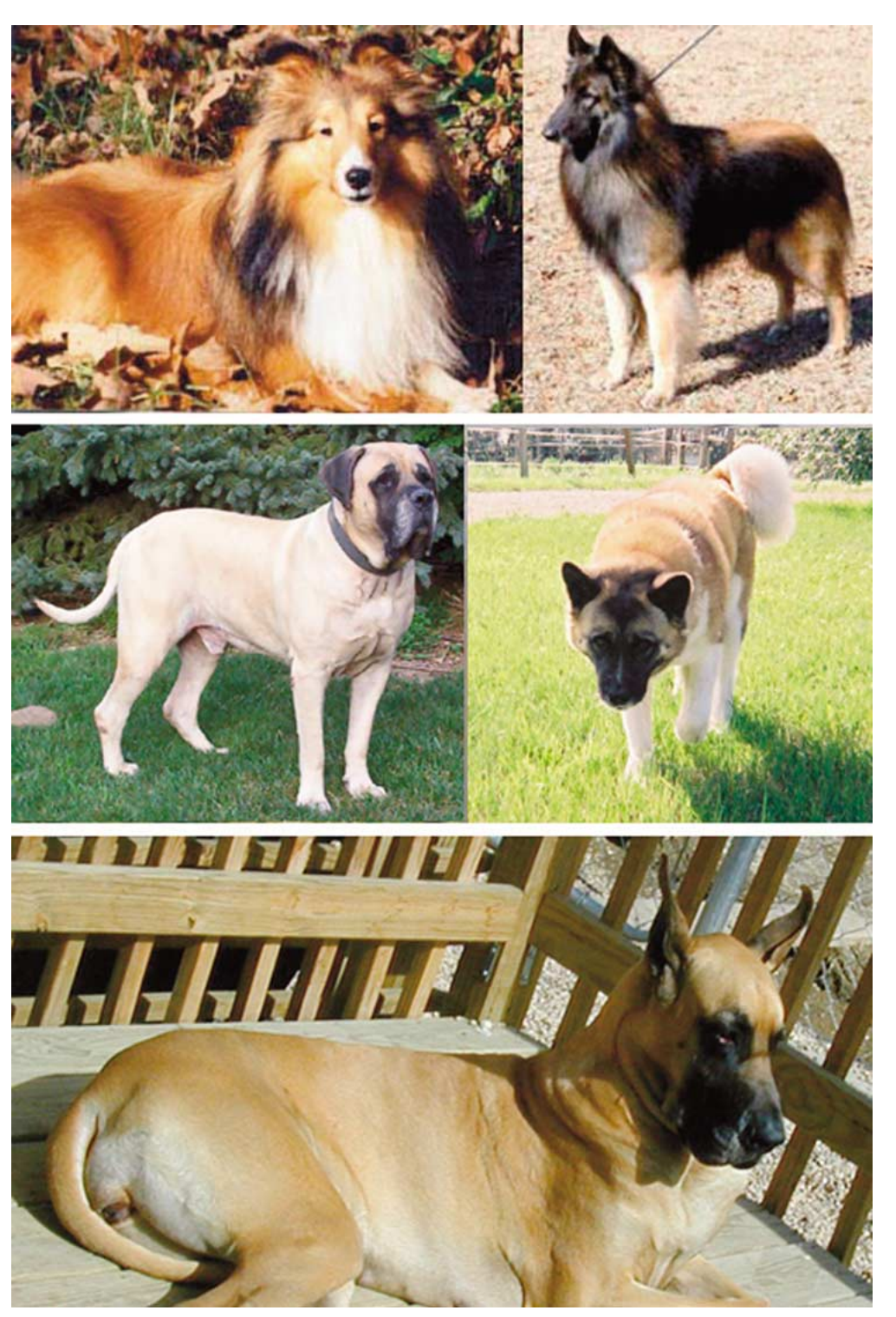
Fig. 2. Photographs of dogs homozygous for the a^y A82S R83H allele illustrate a variety of shades along the fawn–sable spectrum. Clockwise from top left is Peyton, a female Shetland Sheepdog; Rain, a male Belgian Tervuren; Ginny, a female Akita; Tiara, a female Great Dane; and Bull, a male Mastiff.

and German Shepherd Dog was derived from a common ancestor.