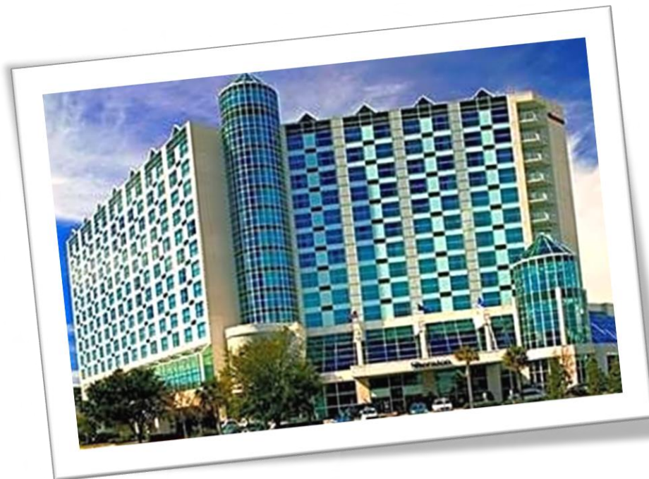
Sheraton Myrtle Beach Hotel and Convention Center